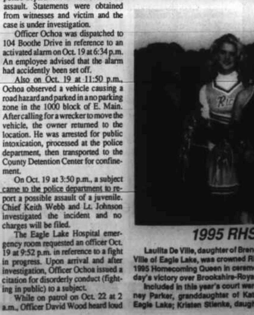
1995 RHS Homecoming Queen, Court